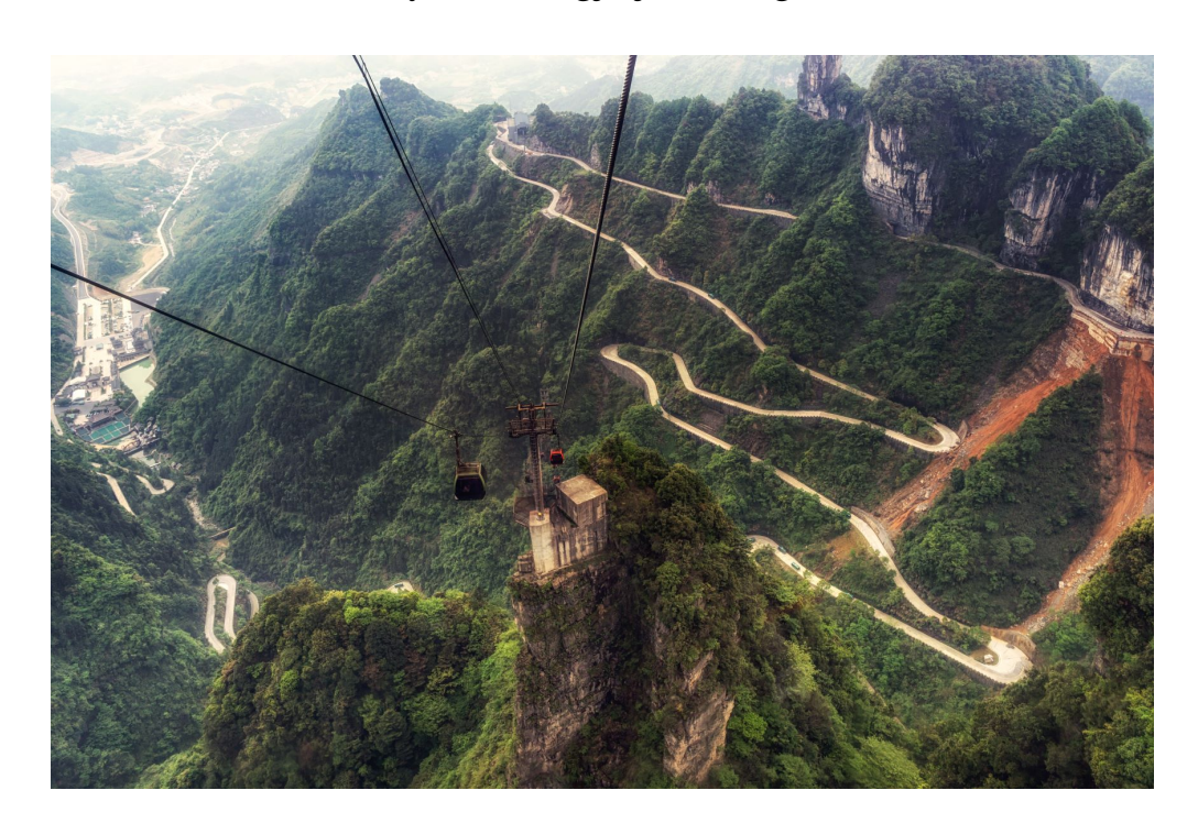
Day 10 Zhangjiajie-Shanghai

Transfer to Mt. Tianmenshan, another visitworth place especially because of the spectacular cable car and breathtaking glassfloor (for walking over) on the mountain. Flight to Shanghai in the evening.