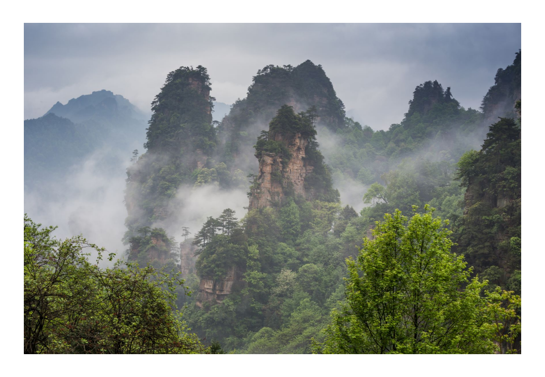
Day 8 Zhangjiajie

Hiking in the Wulingyuan Nationalpark. Visiting the scenery areas Yangjiajie and Tianzishan.