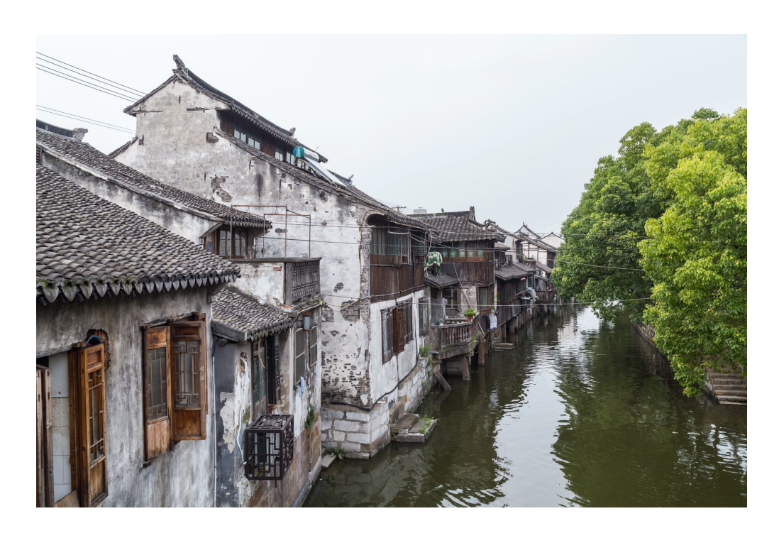
Day 12 Shanghai-Suzhou-Shanghai

One day Garden tour to Suzhou. Visiting some finest gardens in traditional chinese style and enjoying a boat tour on the Grand Canal.