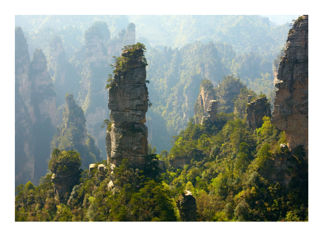
Day 9 Zhangjiajie

Another day hiking in the Wulingyuan Nationalpark. Visiting the scenery areas Huangshizhai and Golden Whip Stream.