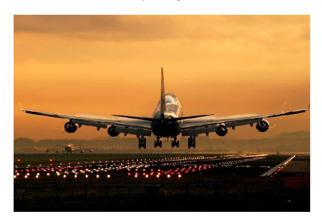
Transfer to airport. Depart.