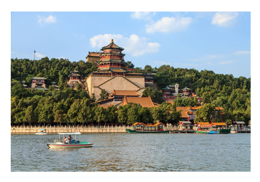
Day 2 Peking

The Imperial Tour to the Forbidden City, the Tiananmen Square and the Temple of Heaven.