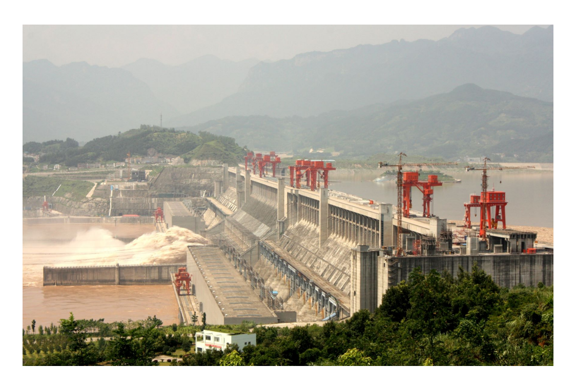
Day 7 Yichang-Zhangjiajie

Disembark in Yichang. Pickup and transfer to Zhangjiajie. A fairy land with floating mountains, which inspired the Film Avantar.