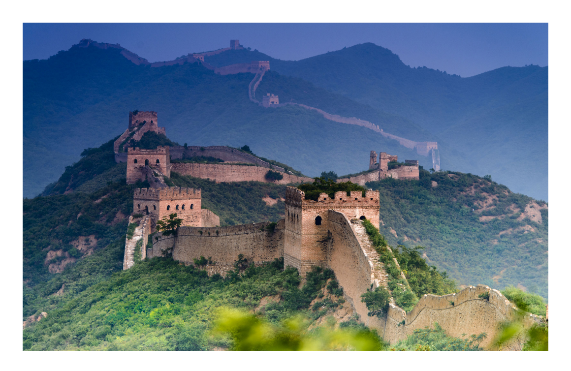
The Heritage Excursion to the Great Wall at the section of Mutianyu incl. an easy hiking. Afterwards enjoy the flavor of Old Beijing in the Hutong Area.