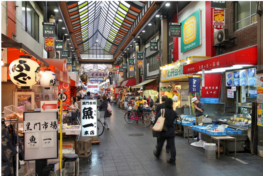
Shikansen Train to Osaka. Visiting Namba, Kuromon market.