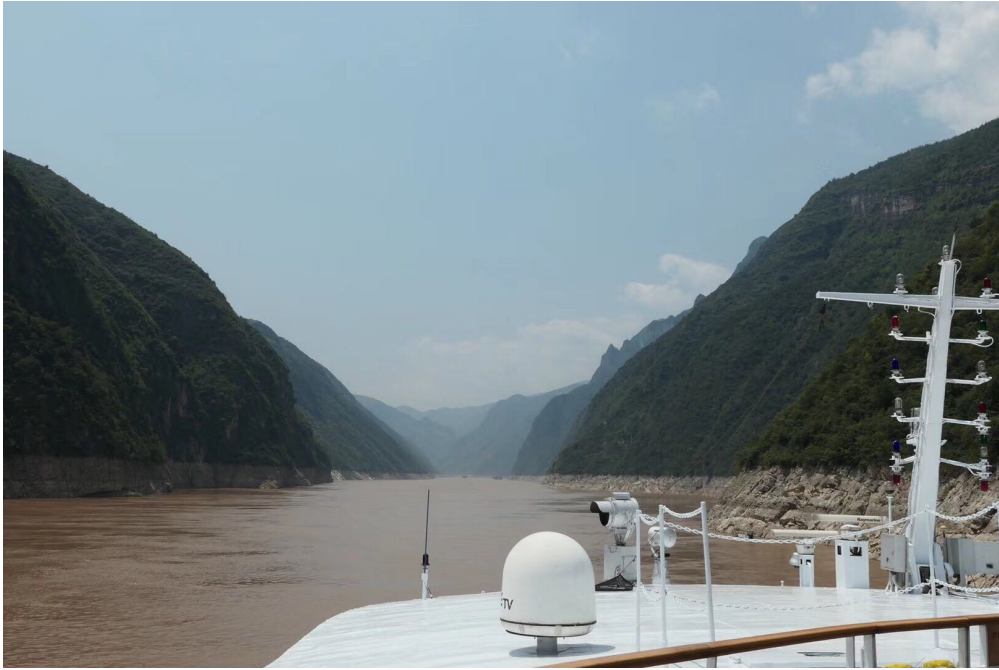
Cruising through the Qutang Gorge.